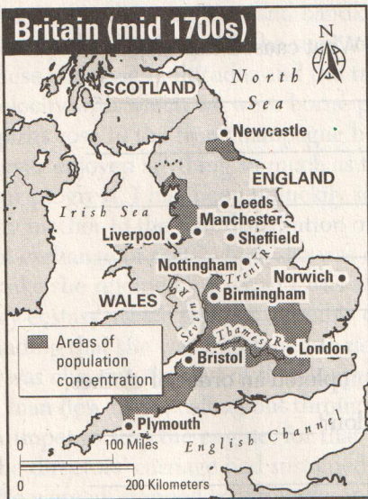
Growth of British Cities 1760–1881

Industrialization also required a large labor force. The enclosure movement, in which wealthy landowners bought out small farms and forced these people out of their livelihood, provided a ready supply of workers. As a result, masses of people moved to the industrial cities to find jobs.